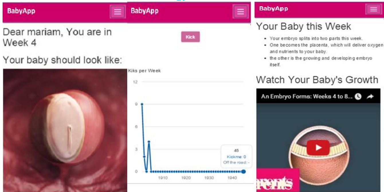
Fig. 3 BabyApp Sample Pages.

Each category in the list has a specified name and an illustrative image/logo. The design of the page is similar to the other pages in application, such as: colour of background and alignment of images. The consistency in design can be considered as an advantage to the entire application. At the top of the page, there is an action bar that contains the logo of the application and the main menu that customer can easily navigate from one page to another. The kicks page allows the member to enter each 'kick', and compute the total mounts of 'kicks' as displayed in Fig. 3 above.