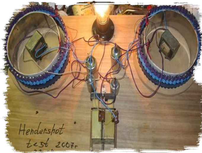
Fig.2: Hendershot fuelless generator with dummy load

The fuelless motor works on compass, and the original model would always operate when pointing north or south, as does the compass, but it will not move when pointed east or west. The great scientist Hendershot worked two years to overcome the defect, and finally he brought a motor to the Bettis field that appeared to be working perfectly. A small model airplane with this motor but this experiment fail it crashed to the ground during one of the experiments. By improving the motor.