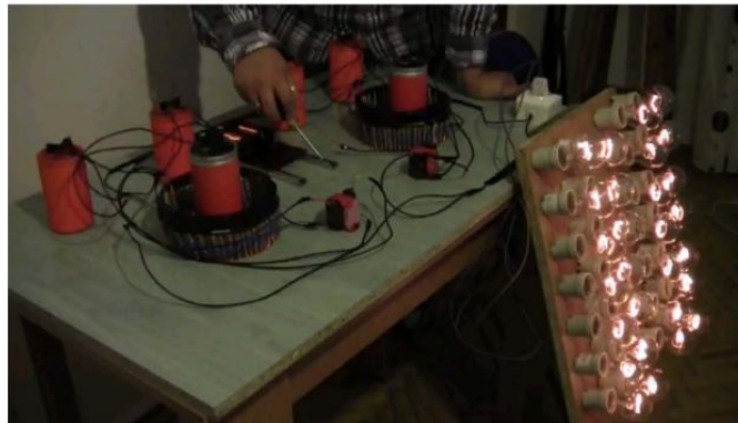
Fig1. Hendershot fuelless generator

on To test the generator, plug an appliance in the socket on the wooden board. Now by moving the sled with the two small coils towards the magnet. By Adjusting the sled's position for best power output. But we have to very careful that not to touch the iron bar with the 2 small coils.