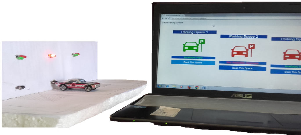
Fig.2 booking a parking slot

In the above figure shows that the two slots are available to book car parking slot and parking space2 is not available as indicate is someone already booked that slot. Hence parking space1 and parking space3 can book now. The working of this system at every stage from checking the availability of parking space to actually park a car in a vacant parking slot. This is done by implementing the smart parking system in the parking area of a shopping mall.