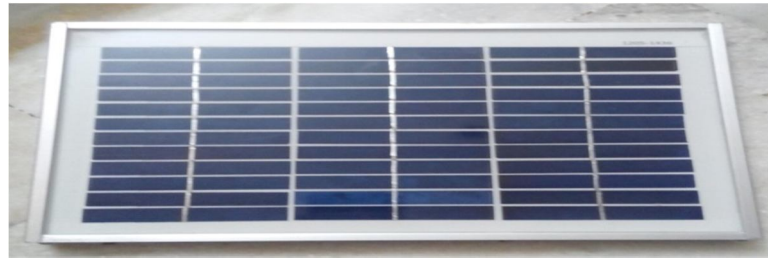
Fig.3.3 Solar Panel