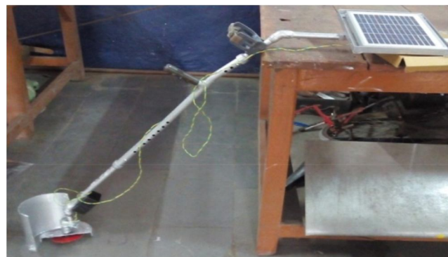
Fig.3.7 Final Assembly