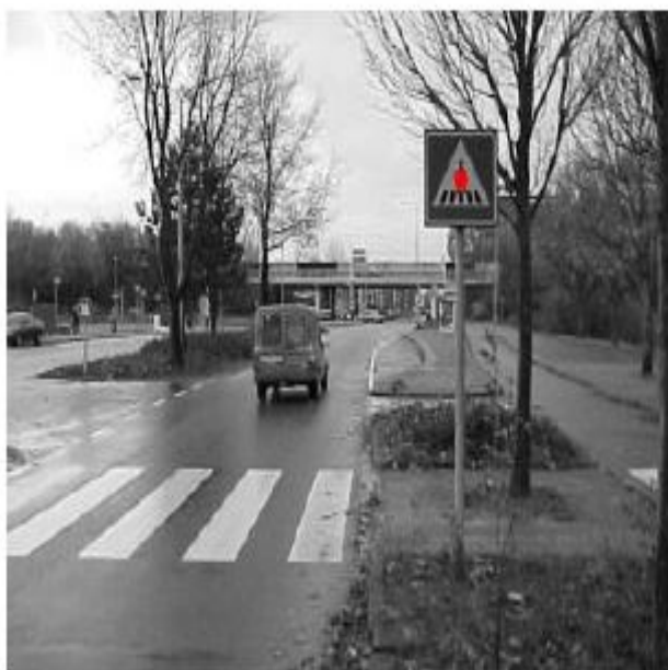
Fig. 3 Sample output

For this system we are considering the recorded video as an input to the proposed system. The video stream is initially segmented into individual RGB. The detection rate for each specific classes is as follows: For pedestrian the detection rate is 100%. For bike class the detection rate is 68.75%.