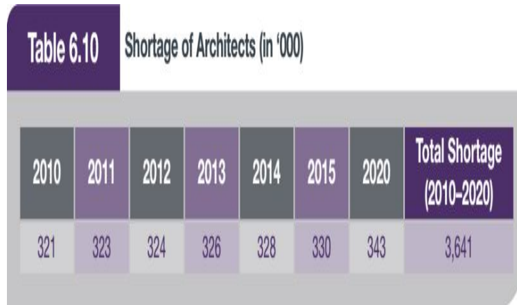
Figure-2: Shortage of Architects.

Nowadays, architectural education and practice are experiencing a shift of Interdisciplinary characterized by the coordinating, articulating, and dominant role of digital technologies. In this new situation the collaboration between architects, architecture education and architecture educators appears to be increasingly necessary a condition. Any creative action takes place in a digital environment which affects all aspects of architectural form from the more abstract and conceptual to its pure materiality. New architectural ideas and concepts related to the generation of forms that correspond to new conceptions of human and social life, of space and time, of nature and context, of speed and change, of communication and globalization, of complexity and order, of stability and movement support and sustain this new condition.