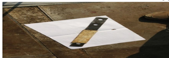
Figure 3 Wall ties

Wall ties are thin plates of dimensions 20cm x 4.5cm x 0.3cm with three holes of diameter 12mm on either side. Wall ties are generally used to tie the form work. Wall ties are so placed from inside the form work. Formwork when once placed is tied together with the wall ties filled with grease and plastic cover is winded over the central portion of the wall tie. Once this arrangement is made the holes of wall tie and the holes of form work are made to coincide and filled using pins and wedges