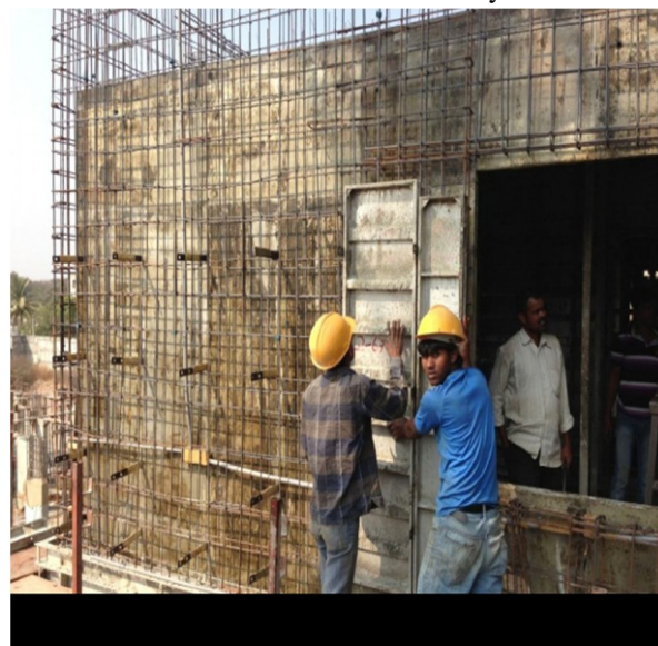
Figure 7. MIVAN formwork

MIVAN form work: MIVAN is an upcoming technology which has empowered and motivated the mass construction projects throughout the world. Good quality construction should not reduce the project speed nor should it be uneconomical. Construction is done through MIVAN technology keeping a motto in mind that “Cost is long forgotten, but the quality is remembered forever.” Mivan is an aluminium formwork system developed by a European construction company. In 1990, the Mivan Company Ltd. From Malaysia started manufacturing these formwork systems. Today, more than 30,000sqm of formwork from Mivan Co. Ltd. is used across the world. There are a number of buildings in Mumbai that are being constructed with the help of the Mivan system, that the proven economical as well as satisfactory for the overall Indian construction environment. One of the architectural examples is XRBIA which uses MIVAN system to achieve its dream of “A House for Every Indian”.