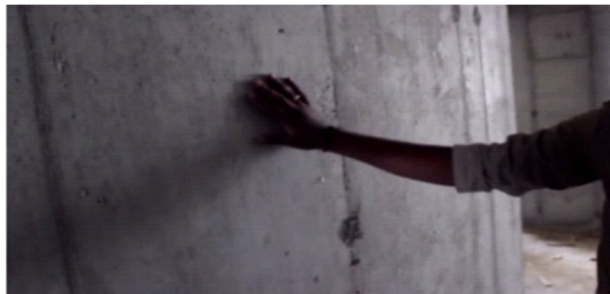
Figure 6 Shear wall after removal of formwork

Curing: After one day of curing of the wall, removal of form is done. Removal of form is done very carefully.