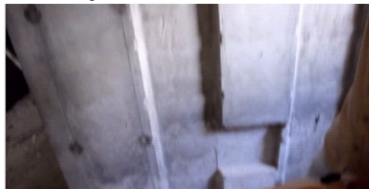
Figure 5 Gaps left for plumbing lines

The electrical lines in slabs and wall also have a design.