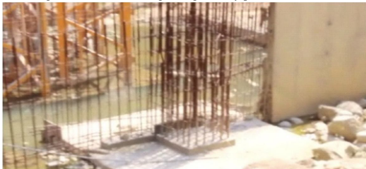
Figure 4. Footings laid for construction

Generally shear walls are opted for tall buildings which are more than 15 floors so that they can resist lateral load most effectively. Therefore for this type of buildings we need strong foundation, so that it can resist high loads due to self weight as well as lateral loads. Hence combined footings and isolated footings are generally preferred.