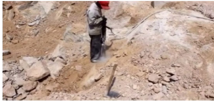
Figure 3. Drilling

Once the excavation is completed marking of land for footings is carried out.