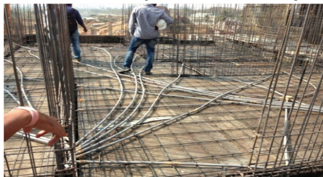
Figure 5. Horizontal reinforcement of shear wall

Shear Walls: Shear walls are generally casted monolithically, in this type of construction the beams and columns are placed inside the walls so that you can never find beams inside any floor in this type of construction. Schedule of reinforcements: After the horizontal reinforcement is placed in accordance with the design, vertical reinforcement is placed.