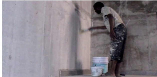
Figure 10 Painting and finishing works

Painting and Finishing Works: As the wall which is obtained is perfectly plain with exact finishes there is no need for and plastering work.