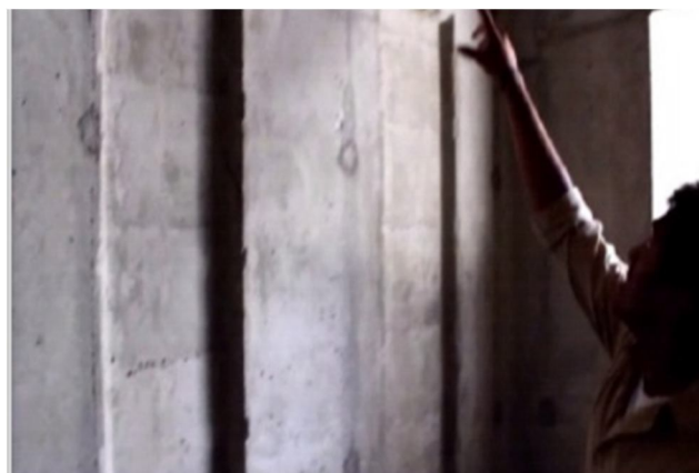
Figure 9 Gaps left for sewer pipes

When it comes to the sewer lines holes or empty gaps are left over. And in these empty spaces the sewer pipes are placed exactly to match the empty spaces.