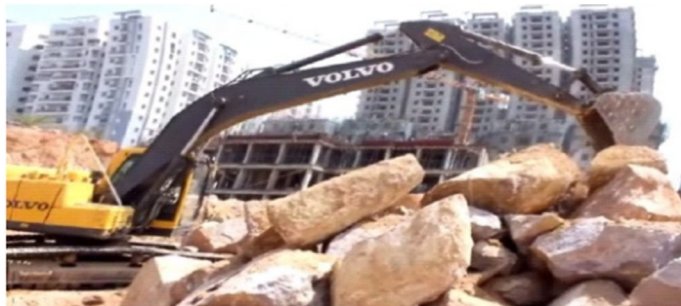
Figure 2 Excavation using heavy earth movers

Excavation: After the initial surveying and soil test, excavation of land carried out. If the land site is very hard with rocks and boulders, excavation is carried out using heavy earthquakes, cranes and diggers, and in some cases if the land is very hard, blasting of site by using small amount of dynamics is preferred. Generally blasting of site is done during early mornings.