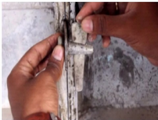
Figure 10. Pins and Wedges

Pins actually resemble the rivets its top diameter of head is 12mm and its tail is about (6-8) mm with a rectangular hole in it 2mm thickness.