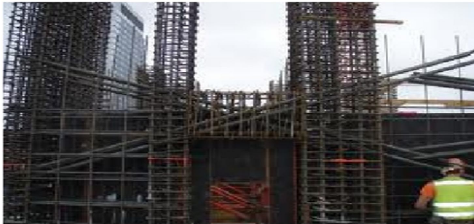
Figure 1 R.C Shear wall

SHEAR WALL: It consists of reinforced concrete walls and reinforced concrete slabs. Wall thickness varies from 140mm to 500mm depending on the number of stories, building age, and thermal insulation requirements. In general, these walls are continuous throughout the building height; however, some walls are disconnected at the street front or basement level to allow for commercial or parking spaces. Usually the wall layout is symmetrical with respect to at least one axis of symmetry in the plan.