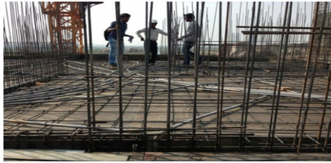
Figure 6. Vertical Reinforcement of shear wall

This reinforcement in the horizontal direction is usually tied as double strand single tie with GI wire, this process can also be done by using rebar machine. Normally cover either cement or most preferably PVC cover is tied to the vertical reinforcement so that once from works place it maintains a specific cover distance. Once the reinforcement is completely placed then comes the part of the MIVAN form work.