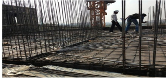
Figure 4 Electrical lines in slab

The shear walls in a building itself acts like column with no flexibility to drill and hence it becomes very important to place electrical lines and plumbing or sewer lines.