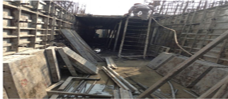
Figure 2 Alluminium panels of MIVAN formwork

proves to be a major advantage as compared to other modern construction techniques. High quality Mivan Formwork panels ensure consistency of dimensions. On the removal of the formwork mould a high quality concrete finish is produced to accurate tolerances and vertically. The high tolerance of the finish means that, no further plastering is required.