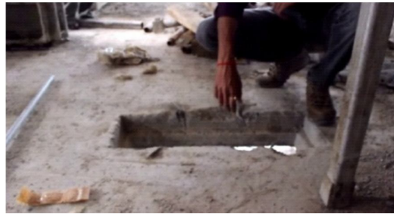
Figure 7 Holes drilled in the slab

Firstly the wedge is taken out by using a hammer and then pin is also removed. Now started from top and one side form is carefully removed. Now started from top and one side removed carefully removed. The form removal is cleaned immediately, to remove the concrete on it, so that it can be reused effectively. Once the form completely removed a smooth finish of wall is obtained which does not require plastering. The wall which is now finished with the removal of form is cured with regular water i.e., water which we use for drinking purpose. Curing of walls is done for 3-7 days continuously and for better curing and to reduce heat of hydration a white coating with lime powder is also preferred. Curing can also be done by covering walls with plastic covers and watering them so that it reduces the heat of hydration. As it becomes difficult to make form work through staircase for constructing the next floor, these holes are drilled in the slab of size a little more than the standard form work.