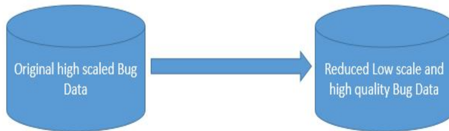
Fig -1: Data Reduction.

Reduction of bug data is a process of reducing data for improving bug data quality which combine feature selection and instance selection on sample bug data. This generate reduce bug data, which is high quality and low scale. Due to data reduction bug triage analysis becomes more efficient and appropriate. Column wise and row wise reduction are two ways of data reduction.