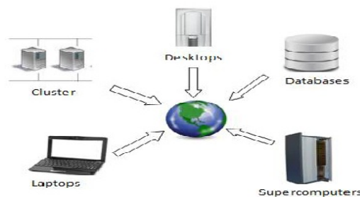
Fig 1: Grid Computing

networked loosely coupled computers acting together to perform large tasks. For certain applications, “distributed” or “grid” computing, can be seen as a special type of parallel computing that relies on complete computers (with onboard CPUs, storage, power supplies, network interfaces, etc.) connected to a network (private, public or the Internet) by a conventional network interface, such as Ethernet. This is in contrast to the traditional notion of a supercomputer, which has many processors connected by a local high-speed computer bus.