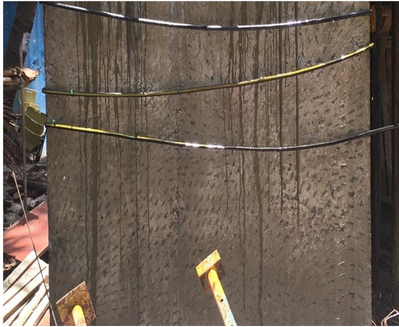
Figure no 7:- Drip curing applied on a lift shaft on site