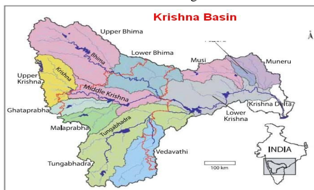
Fig. 1 Location of Krishna River Basin

Below Wai, the valley widens out, and on the right bank, is joined by the leading tributaries Kudali Vena, Urmodi and Tarali. The valley floors are well-cultivated and well-populated, the streams draining in the valleys have carved out small amphitheatres into the sides of the intermediate ridges. The sides of these ridges are generally bare but carry poor grass and scrub, and are usually given to grazing, and some of the tops carry the ancient fortified sites like Vairatgad.