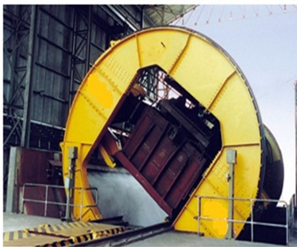
FIG 3 WAGON UNLOADING SYSTEM- WAGON TIPPLER

A control room will be provided adjacent to the track hopper for the operation of the line side equipment and the associated compressor if any. Generally the time taken for unloading the rake would be less than 1 hour. The unloading rate is quite fast for the sized material.