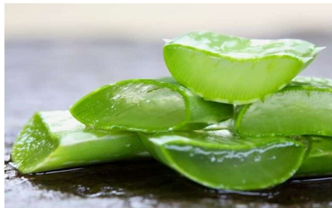
Fig.2 :Aloe vera (barbadensis miller)

Aloe vera is a cactus-like plant that grows easily in hot, arid climates and is farmed in enormous amount. Aloe barbadensis is a member of the 300 species-strong Liliaceae family. Aloe vera gel, a mucilaginous substance found in the centre of aloe vera leaves, is used to make beauty products and some medicines. Aloe vera gel contains no Antraquinone. They are in charge of aloe's potent laxative effects. Nevertheless, antraquinone may be present in whole leaf extract. [5] There are 75 potentially active components in aloe vera, including vitamins, enzymes, minerals, sugars, saponins, and amino acids. [6]