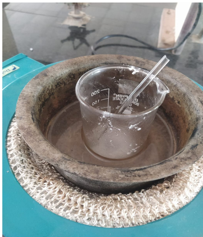
Fig.5: Formulation of Cream Base