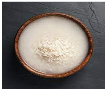
Fig1:Rice ( Oryza sativa )

To enhance the skincare advantages of rice face creams, these components are frequently combined with hyaluronic acid, niacinamide, and glycerin. They are safe for all types of skin, even fragile skin, and are suitable for use as a daily moisturiser or as a remedy for dehydrated or dry skin.