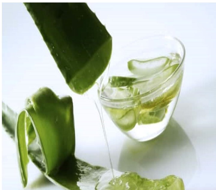
Fig.4 Formulation of cream

In a borosilicate glass beaker, heat liquid paraffin and beeswax to 75 °C and keep it there throughout the heating process. (Phase oil). Borax and methylparaben should be dissolved in distilled water and heated in a separate beaker to 75 °C to produce a clear solution. Phase of water. The heated oily phase will then gradually receive this watery phase . [10] Then incorporate a precise amount of Aloe Vera gel, rice extract (starch), and vigorously stir until a creamy cream appears. Then, as a fragrance, add a few drops of rose oil. Place this cream on the surface and, if necessary, add a few drops of distilled water. Then, mix the cream geometrically on the slab to give it a smooth texture and ensure that all the elements are thoroughly combined. Slab technique or extemporaneous cream preparation is the name of this technique. (Table 1 is the formulation table.)