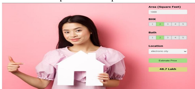
Figure 1 Result

Depending on the dataset, model, and evaluation standards used, the results of using machine learning to predict housing prices can differ. Important outcomes include the ability to predict prices with accuracy, the identification of noteworthy features, the avoidance of over- or underfitting, the comparison of models, and insights into the factors affecting pricing. Careful analysis and interpretation are necessary in order to create reliable predictions and prudent actions.