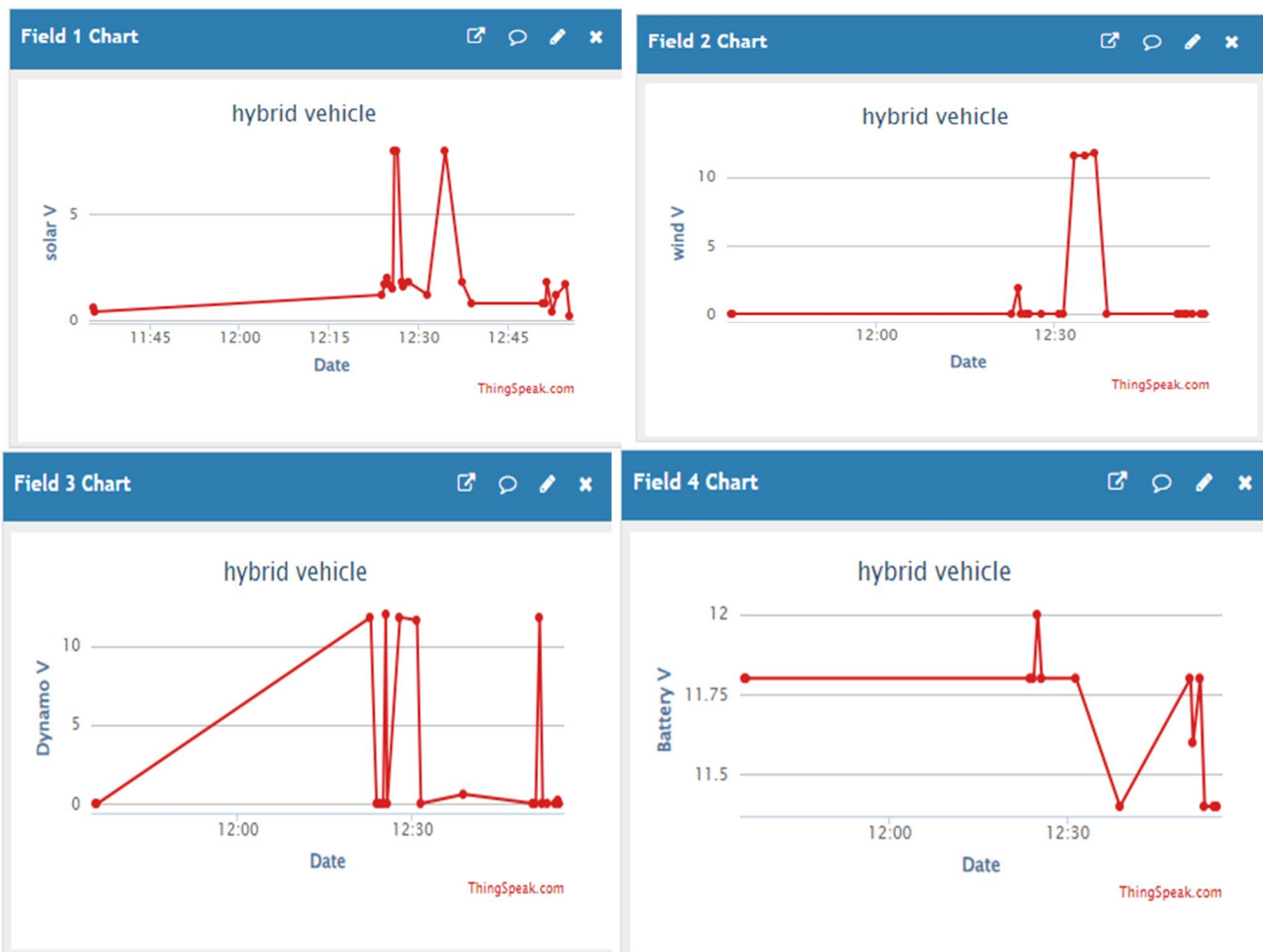
Figure.3: Thingspeak channel status