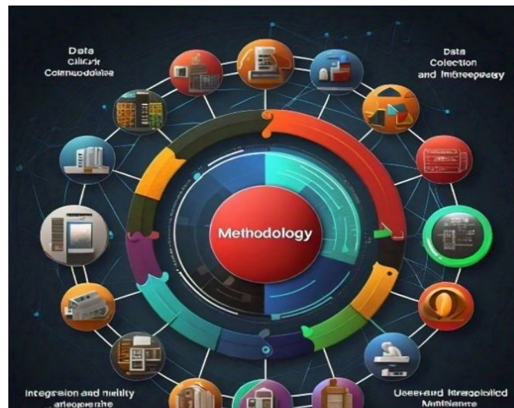
Fig. 1 Methodologies used in IOT