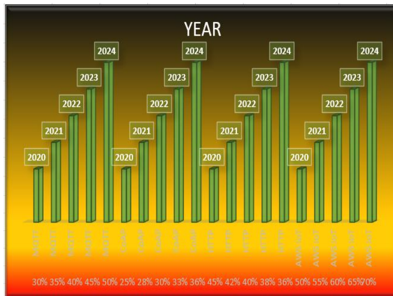
Fig. 2 Technology Adoption Rates in IoT for Smart Cities (2020-2024).