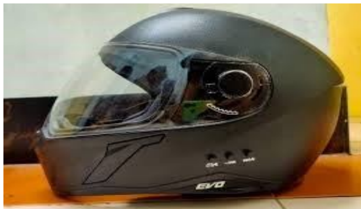
Fig.2 Smart Helmet