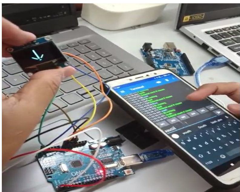
Fig.3 Working Circuit