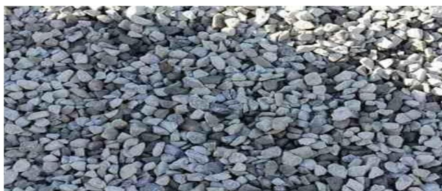
Fig 3. Coarse aggregate