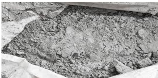
Fig 1. Cement

Generally use of high grade cement offers many advantage for making stronger concrete Ordinary Portland cement (OPC) of 53 Grade (Ambuja cement) was used throughout the course of the investigation. It was fresh and without any lumps. OPC 53 Grade cement is required to conform to BIS specification IS:12269-1987 with a designed strength for 28 days being a minimum of 53 MPa or 530 kg/sqcm.. Cement was carefully stored to prevent deterioration in its properties due to contact with the moisture. The various tests conducted on cement are initial and final setting time, specific gravity, fineness and compressive strength.