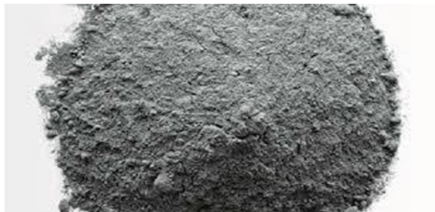
Fig 5. Fly ash

Fly ash significantly improves concrete performance and also provides many benefits in cement and non-cement applications. Also, when treated with sodium hydroxide, fly ash appears to function well as a catalyst for converting polyethylene into a substance similar to crude oil in a high temperature process called pyrolysis.