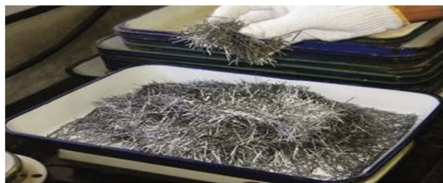
Fig 4. Steel fibre

Steel fibre is a metal reinforcement. Steel fibre for reinforcing concrete is defined as short, discrete lengths of steel fibres with an aspect ratio (ratio of length to diameter) from about 20 to 100, with different cross-sections, and that are sufficiently small to be randomly dispersed in an unhardened concrete mixture using the usual mixing procedures. A certain amount of steel fibre in concrete can cause qualitative changes in concrete's physical property, greatly increasing resistance to cracking, impact, fatigue, and bending, tenacity, durability, and other properties. Basically, steel fibre can be categorized into five groups, depending on the manufacturing process and its shape and/or section: cold-drawn wire, cut sheet, melt-extracted, mill cut, and modified cold-drawn wire. In 2003, Wen and Chung first fabricated cement paste with self-sensing properties using steel fibres with a length of 6 mm and diameter of 8 \mu\text{m} . Hong employed steel fibres with a length of 32 mm and diameter of 0.64 mm to develop self-sensing concrete. Hou and Lynch also developed an engineered cementations composite with sensing properties by incorporating steel fibres. Teomete and Kocoyigit used steel fibre with a length of 6 mm to fabricate self-sensing concrete with tensile strain-sensing properties.