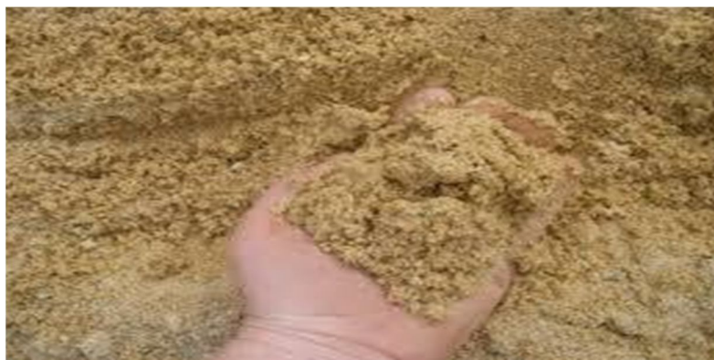
Fig 2. Sand