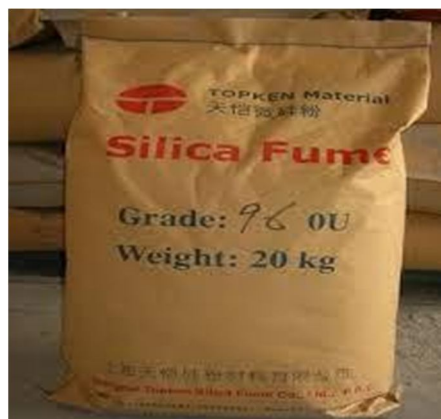
Fig.6 Silica fume