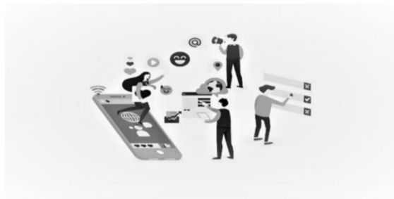
(Fig-1 customer scrolling to ecommerce sites)

Online retail sales will operate mainly with (B2C) Business to customer's sales. The most selling products in e-commerce websites in India are Fashion, Electronics, Beauty, kitchens, Furnishing, Food, Books, Jeweler, Handmade Products, and Medical and Health Supplements. And the top product and services selling e-commerce websites are AmazonIndia.com, Flipkart.com, and Myntra. They have a large sales market in India, mainly operate with (B2B) Business to Business Market sale and (B2C) Business to customer's market.