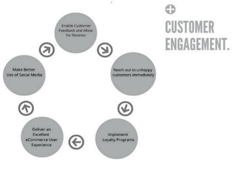
(Fig 3 – Channels of customer engagement)

Along the lines of following the online trends desired by the customers, social media marketing for the exact purpose of influencing people to buy their products. Compact elaboration about the special features is Myntra studio- this actively demonstrates that the fashion freaks exhibit their fashion advices and recommends clothes for the watchers, and Myntra provides the similar clothes displayed by the person as a post. Myntra Insider (loyalty program) - a membership deal without any monetary terms for the active users and rewards points, perks and privileges with every purchase. This program will engage with alliance partners who wish to promote, intensify its business or product, and collaborate with Myntra for various exclusive discounts and offers for the insiders or the participants, this demonstrates high customer engagement for loyal users and provides an opportunity to them, along the lines of fashion tips and advices from top celebrities of India, VIP access to all sale events. Explore on Myntra with Myntra move signifies that the users are rewarded for an active lifestyle by the fitness data of the user converted to shopping currency/ coupons, playing simple games and earning rewards further used while purchasing. These all features indicate the excessive efforts by Myntra for customer satisfaction and are completely successful.