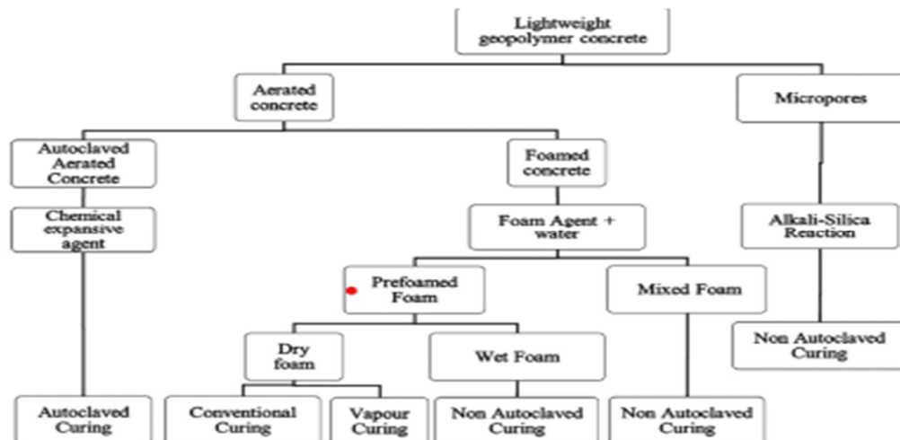
Fig. 2 — Methods to produce lightweight geopolymer concrete.