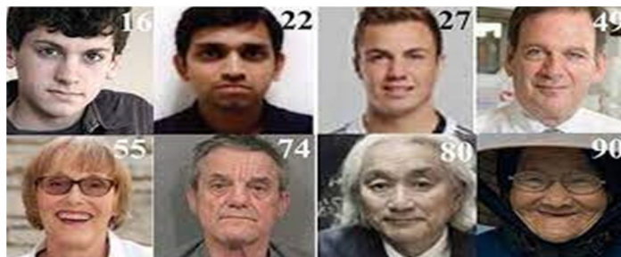
Fig.3. Sample images of UTKFace dataset.