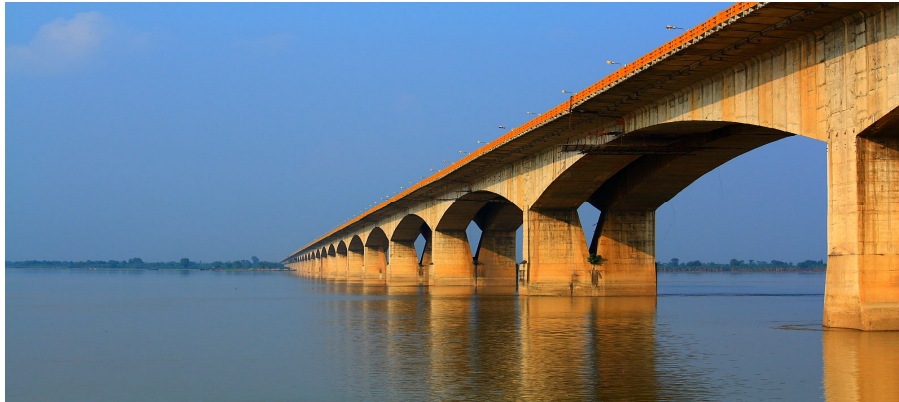
Fig -1: Ganga Sethu Bridge Patna

A bridge is a building designed to span an obstacle so that traffic can go freely across it. A bridge has played a significant part in the development of a place from ancient times by increasing its connectedness with other places, hence enhancing trade and economy. An obstruction may be a river, stream, canal, valley, ditch, highway, railroad, etc. Bridges come in many different varieties. However, PSC bridges are now the best option for building long span, important bridges. Prestressed concrete bridges are primarily employed because they are quick to build, simple to construct, and competitively priced with alternatives like steel and reinforced concrete. A famous PSC bridge in India is the Ganga Bridge in Patna. It is an example for major PSC Bridge in India (See Fig.1).