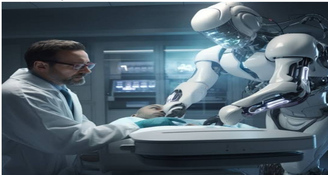
Fig. 6: AI-assisted Robotic Surgery. [22]

its big size and inability to work with extremely detailed and delicate tissues. Their robot somewhat relies on flexible components and small, worm-like arms. The programmer consider it can be applied later in ophthalmology, e.g. in cataract surgery A telemanipulator is a remote controller that allows the surgeon to execute the ordinary activities related with the surgery in the meantime the robotic arms complete those movements using end-effectors and manipulators to do the real surgery on the patient. In computer-controlled systems the surgeon utilizes a computer to deal with the robotic arms and its end effectors, however these systems still utilize telemanipulators for their information.