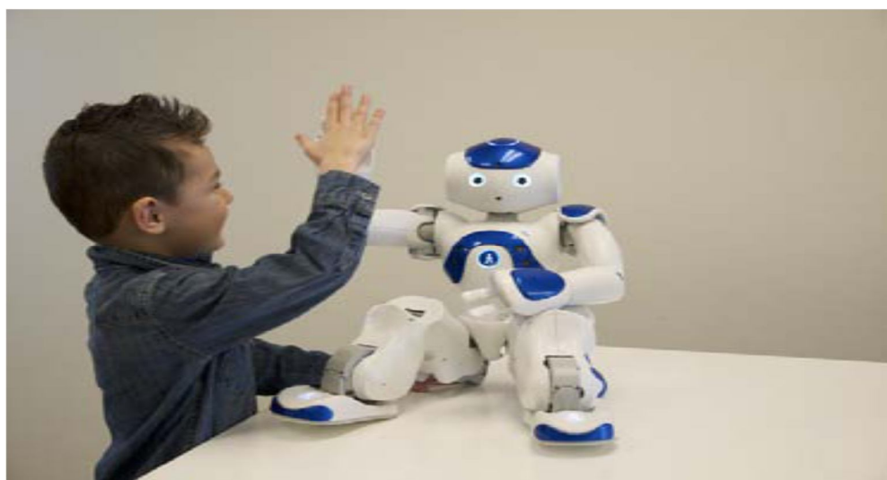
Fig. 3: MEDi Robot