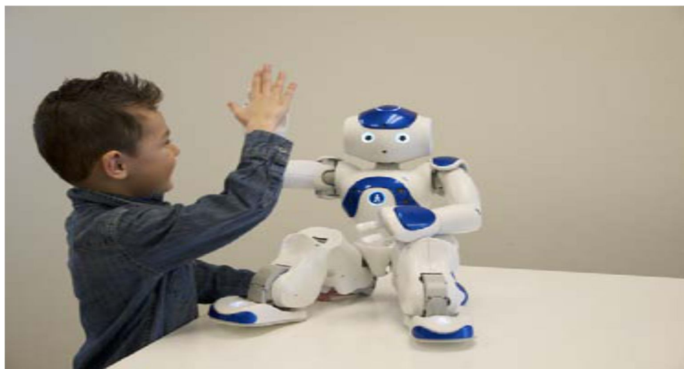
Fig. 3: MEDi Robot