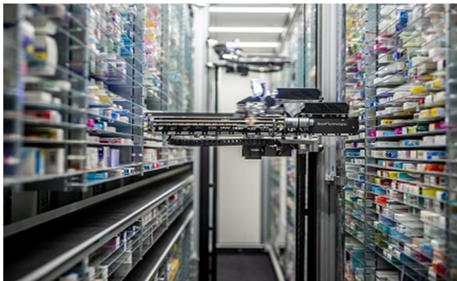
Fig. 2: Robotic Pharmacy. [8]

In AI, machines imitate critical thinking capabilities with other human personalities. As of now, most of the applications of AI are primitive as they are designed to do limited tasks and to a limited extent. AI works through multiple paths, allowing systems to discover new patterns and derive their own rules when given with data and new experience. Some of the critical applications of AI in pharma are designing treatment plans, checking the accuracy of medicine and in drug creation. Major pharma companies are adopting AI software or partnering with AI-based start ups to accelerate drug discovery. With AI, customization of dosages can be achieved based on individual patient characteristics. AI is also increasingly being used to detect drug effectiveness and to understand adverse drug events. It may also help accelerate drug approval processes by the regulatory authorities. [10]