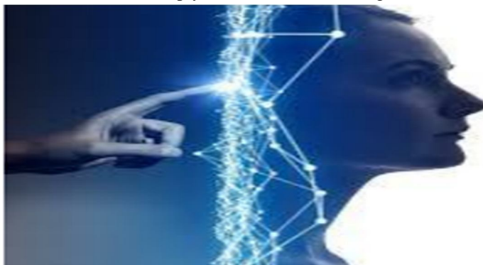
Fig. 5: Challenges to adoption of AI in pharma. [14]