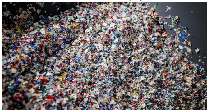
Fig. 1 Waste Plastic Pieces

It is a fabric involved in any of a huge variance of unnatural or semi-synthetic organics that are flexible and can be cast into stable objects of various pattern and sizes. Plastics are usually natural polymers of excessive molecular weight; however, they frequently include different matter. They are typically synthetic, maximum in many instances got from petrochemicals, however many are in part inartificial. Plasticity is the widespread property of many substances which are capable of immutable deforming barring failure, however, this happens to such a diploma with that classification of ductile polymer that their title is focused on this ability.