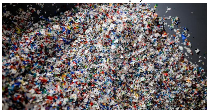
Fig. 1 Waste Plastic Pieces

It is a fabric involved in any of a huge variance of unnatural or semi-synthetic organics that are flexible and can be cast into stable objects of various pattern and sizes. Plastics are usually natural polymers of excessive molecular weight; however, they frequently include different matter. They are typically synthetic, maximum in many instances got from petrochemicals, however many are in part inartificial. Plasticity is the widespread property of many substances which are capable of immutable deforming barring failure, however, this happens to such a diploma with that classification of ductile polymer that their title is focused on this ability.