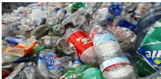
Fig. 2 Waste Plastic