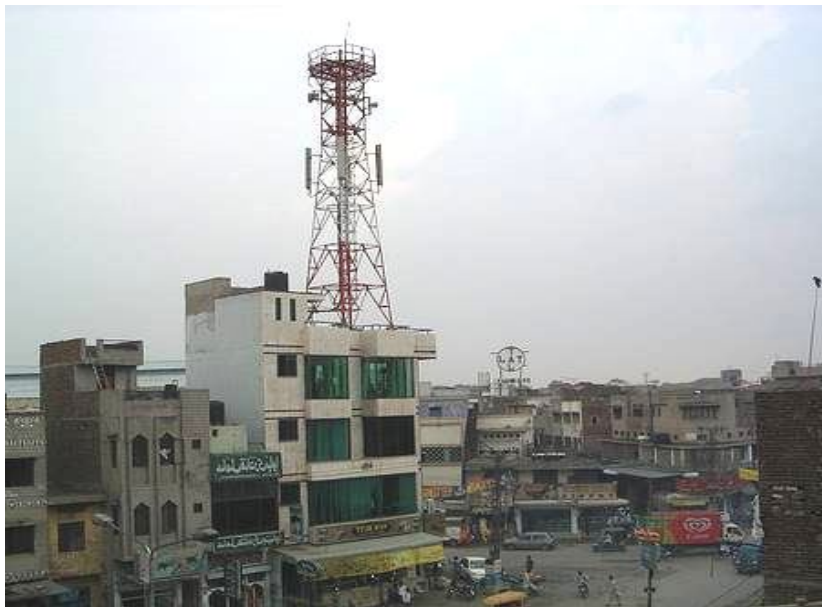
Fig. 1: Structure with Telecommunication tower at top

Each type embodies a unique blend of design, functionality, and suitability, catering to the multifaceted demands of the telecommunication landscape.