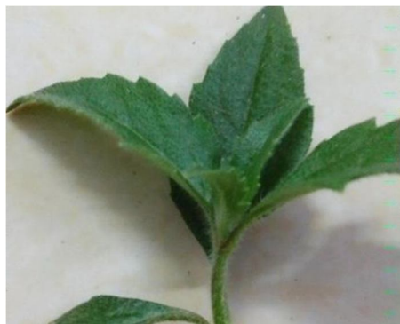
Figure: 2 . Leaves