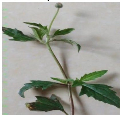
Figure : 4. Inflorescence