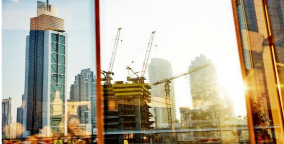
Fig 1.1 Infrastructure sector in India

The seamless flow of input credit throughout the whole supply chain and across the nation for supply of Goods or Services is one of the major goals of introducing GST. Since April 1, 2019, Real Estate sector has been split from the Input Tax Credit ('ITC') builders and developers have the choice to either stay in 12 % GST slab with ITC (8 per cent for affordable housing) or opt for five per cent GST rate (one per cent for affordable housing) with no ITC for ongoing residential projects. Additionally, new residential projects could not reap the benefits of this option as they would have to adhere to the 5 % GST rate (one percent for affordable housing) without ITC.