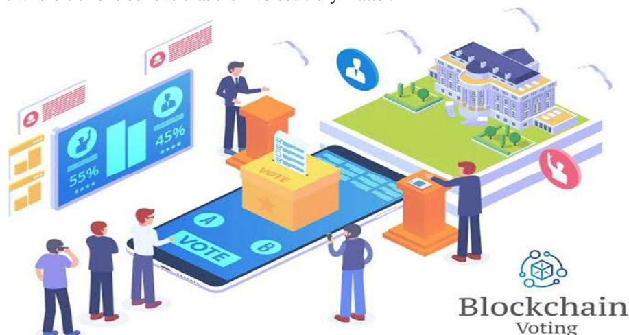
Proposed System Visualization

Electoral integrity forms the foundation of democratic systems, ensuring that elections are conducted with fairness, transparency, and credibility. This concept encompasses a broad spectrum of standards and procedures designed to maintain the legitimacy of the voting process, from accurate vote tallying to fraud prevention and safeguarding voters' rights. High standards of electoral integrity are vital to bolster public confidence in democratic institutions and maintain the stability of political frameworks. If electoral integrity is compromised, it can lead to political instability, decreased voter engagement, and questions regarding the legitimacy of the elected leadership. Thus, upholding stringent standards of integrity in elections is essential for fostering a trustworthy and robust democratic environment where citizens believe that their voices truly matter.