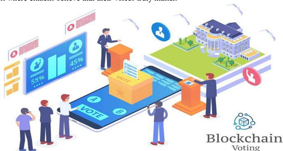
Proposed System Visualization

Electoral integrity forms the foundation of democratic systems, ensuring that elections are conducted with fairness, transparency, and credibility. This concept encompasses a broad spectrum of standards and procedures designed to maintain the legitimacy of the voting process, from accurate vote tallying to fraud prevention and safeguarding voters' rights. High standards of electoral integrity are vital to bolster public confidence in democratic institutions and maintain the stability of political frameworks. If electoral integrity is compromised, it can lead to political instability, decreased voter engagement, and questions regarding the legitimacy of the elected leadership. Thus, upholding stringent standards of integrity in elections is essential for fostering a trustworthy and robust democratic environment where citizens believe that their voices truly matter.