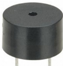
Fig 5. Buzzer

An Arduino buzzer is also called a piezo buzzer. It is basically a tiny speaker that you can connect directly to a Microcontroller (Arduino Uno). It's works as an alarm unit when sensors (ultrasonic sensor, water sensor and heat flame sensor) detect any obstacles in front of the blind user and through this alarming unit or buzzer blind user get alert when buzzer starts sounding after sensors detecting any hurdle in front of the user. You can make it sound a tone at a frequency you set. The buzzer produces sound based on reverse of the piezoelectric effect.