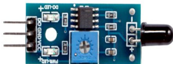
Fig 4. Heat flame Sensor

Heat flame Sensor which is used as obstacle detector where it transmits the infrared waves and hits the object and reflected back the signal to sensor. It ranges from 700nm to 1mm. IR output various depending on infrared rays that have been received. Since, this variation cannot be analyses as such, output provide for comparative circuit. If IR receiver does not receive any signal, the output of the compactor goes low and LED does not glow whereas if it receives any signal, the output goes high and LED Starts Glowing.