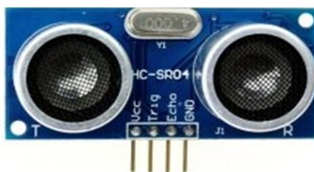
Fig 2. Ultrasonic Sensor

The ultrasonic sensor module will read the distance between the sensor module and the obstacle surfaces, and it will send that data to the Arduino Uno microcontroller which will according to the programming will detect the position of the obstacles in the front of the blind user and according to the set range it will calculate the distance and alert the user it has to move in the necessary direction or not if obstacle detect in the front of the blind user then microcontroller(Arduino Uno) will received the signal's according to the programming and buzzer will start alert alarming or alert sound.