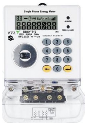
Fig 1.3 Prepaid meter