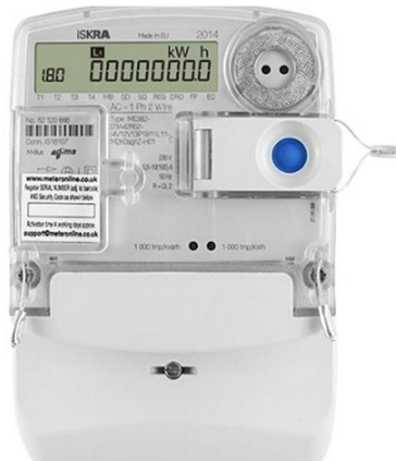
Fig 1.2 Smart Meter