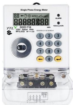
Fig 1.3 Prepaid meter