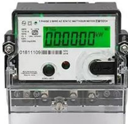
Fig 1.1 Digital Meter