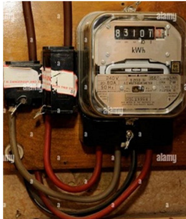
Fig 1.0 Analog Meter