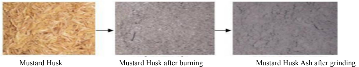
Fig. 1: Steps for obtaining MHA

By examining the effects of mustard husk ash on the properties of porous concrete, this study seeks to close this research gap.