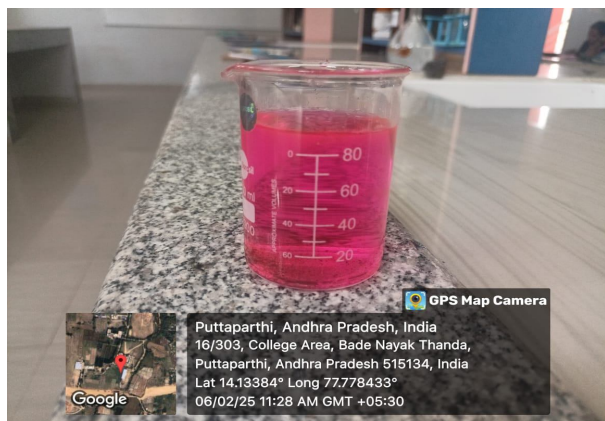
Fig 1. Industrial Waste Water Sample