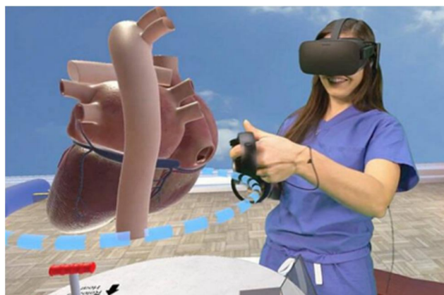
A clinician explores The Stanford Virtual Heart, an interactive, 3D model that helps demonstrate many common congenital heart defects.

To aid medical students and patients in comprehending and managing pediatric congenital heart defects, Stanford University, Lighthouse Inc., and Oculus partnered to develop The Stanford Virtual Heart. Launched in 2017, it is currently utilized in pediatric cardiac centers and educational institutions worldwide. Users put on a VR headset to view an interactive, 3D heart, which includes various kinds of defects such as a hole in the septum or improperly attached valve. The user wearing the headset has the ability to “teleport” into the heart, allowing them to observe its chambers, vessels, and blood circulation, gaining insights into the effects of various defects