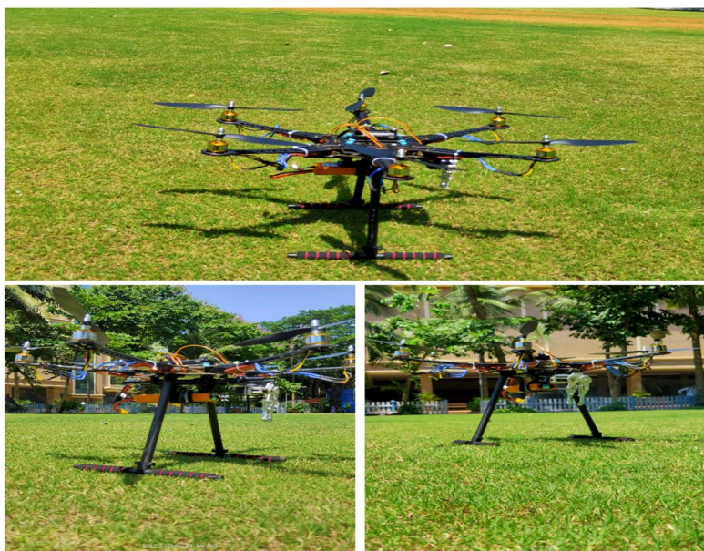
Figure 2: Proposed system for fire extinguishing UAV.