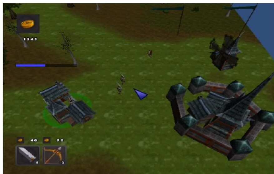
Fig. 2. Screenshot from the RTS implementation