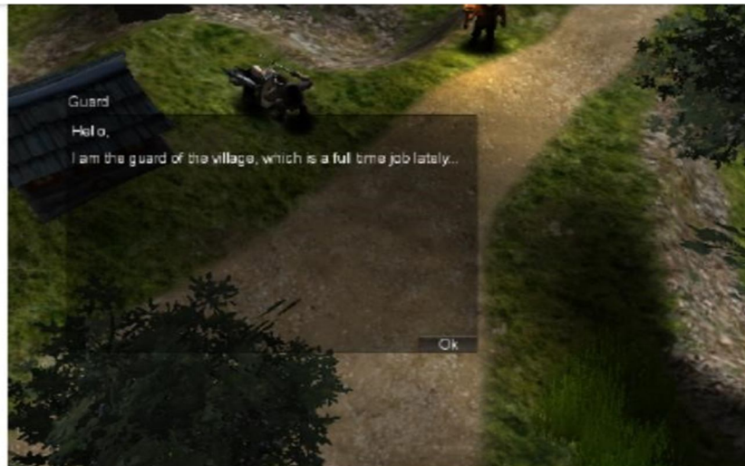
Fig. 1. Screenshot from the RPG implementation

These technical implementations illustrate the seamless integration of GAMYGDALA into game development, showcasing its potential to add emotional depth and complexity to diverse gaming genres with minimal coding effort.