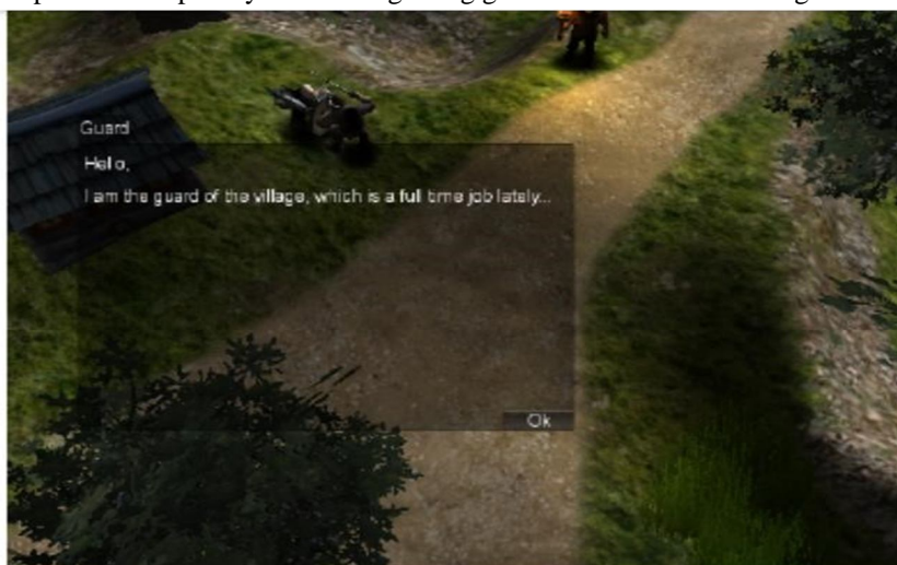
Fig. 1. Screenshot from the RPG implementation

These technical implementations illustrate the seamless integration of GAMYGDALA into game development, showcasing its potential to add emotional depth and complexity to diverse gaming genres with minimal coding effort.