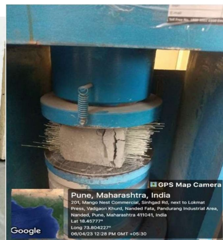
Fig No. 5