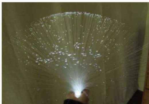
Fig No. 1