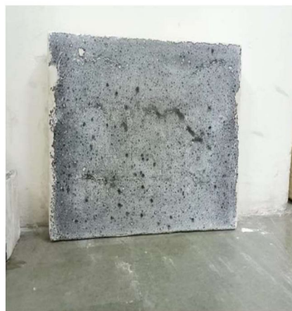
Fig No. 4