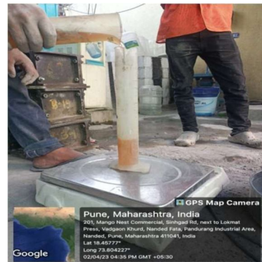
Fig No. 3