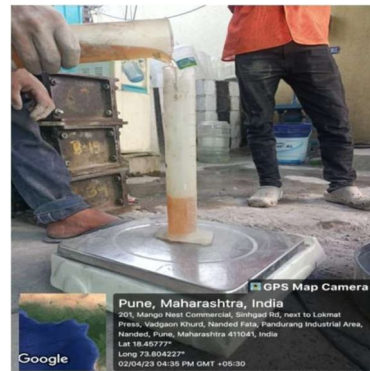
Fig No. 3