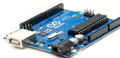
Arduino Uno (R3)

1) Arduino Uno (R3) : The Uno is a huge option for your initial Arduino. It consists of 14-digital I/O pins, where 6-pins can be used as PWM (Pulse Width Modulation Outputs), 6-analog inputs, a reset button, a power jack, a USB connection and more. It includes everything required to hold up the microcontroller; simply attach it to a PC with the help of a USB cable and give the supply to get started with a AC-to-DC adapter or battery.