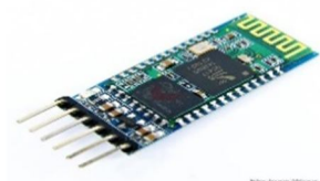
HC-05 Bluetooth Module

2) HC-05 Bluetooth Module : HC-05 is a Bluetooth module which is designed for wireless communication. This module can be used in a master or slave configuration.