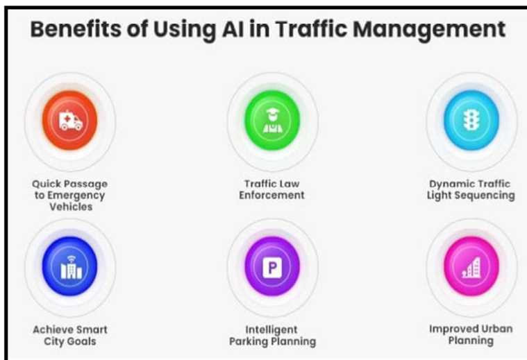
Fig 1. Significance of applying AI in traffic management