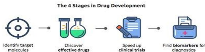
Fig III.I. The 4 stages in Drug Development

The linchpin of AI's impact lies in its capacity for early disease detection, ushering in a new era where subtle patterns and signs are discerned, making early intervention a standard practice. This capability is particularly vital in conditions where early detection plays a decisive role in shaping patient outcomes. In the realm of personalized medicine, AI plays an instrumental role by harnessing patient-specific data, such as genetics and treatment history, to craft tailored treatment plans. This precision medicine approach not only amplifies the efficacy of therapies but also minimizes the likelihood of adverse effects, ushering in a paradigm shift towards patient-centric healthcare.