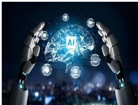
Fig 1: Artificial intelligence (AI)

Artificial intelligence (AI) refers to the simulation of human intelligence in machines that are programmed to think and learn like humans. It involves the ability to reason, discover meaning, generalize, and learn from past experiences.