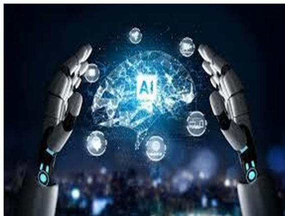
Fig 1: Artificial intelligence (AI)

Artificial intelligence (AI) refers to the simulation of human intelligence in machines that are programmed to think and learn like humans. It involves the ability to reason, discover meaning, generalize, and learn from past experiences.