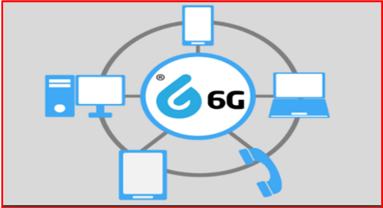
Fig (2) 6G Technology Illustration

6G technology refers to the sixth generation technology. It is proposed to integrate 5G technology for a global coverage. For resource monitoring and weather information multimedia video and high-speed Internet connectivity and the Earth imaging satellite networks are used. To integrate these three kinds of satellite like telecommunication, navigation, multimedia networks which provide global positions, internet connectivity with high speed and for mobile user's weather information services are major three objectives for 6g technology.