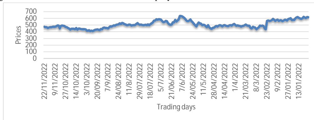
Fig 5 Plot of the underlying price of Coca-Cola for 2022

From the result in Table 5, we observed that the Skewness is positive (4.94) and highest kurtosis of about 42.8 with low volatility of about 0%, meaning low risk in the investment of Coca-Cola Company for 2022.