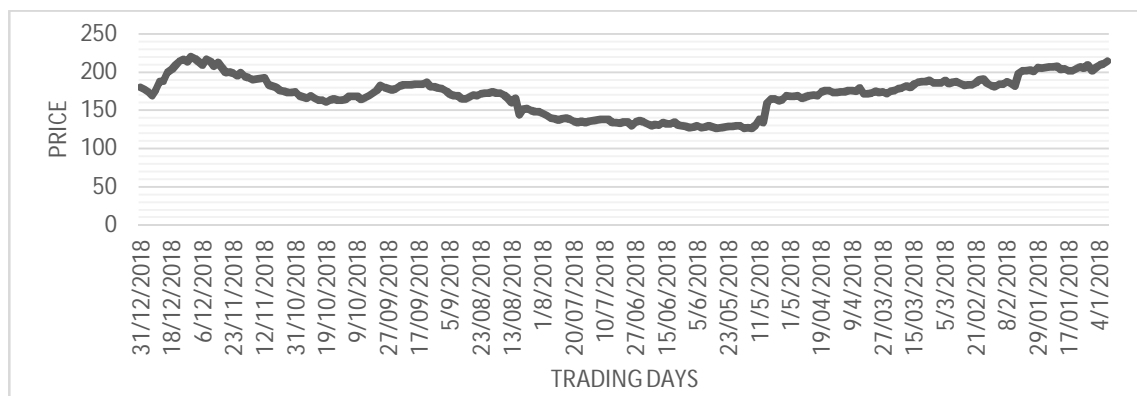
Fig 1 Plot of the underlying price of Coca-Cola for 2018

Figure 1 is a plot of the underlying price of Coca-Cola Company for year 2018. From the plot, we observed that there are fluctuations during the trading days.