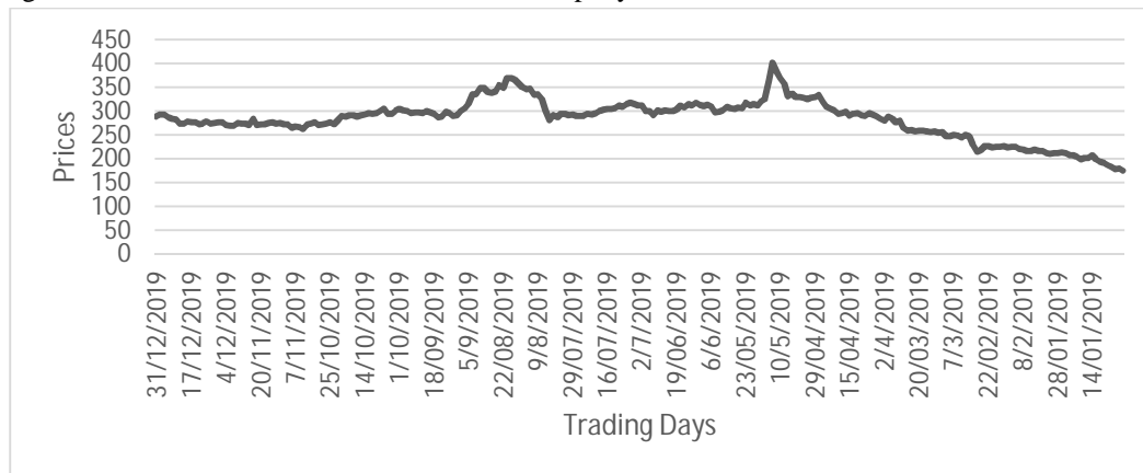
Fig 2 Plot of the underlying price of Coca-Cola for 2019

From the result in Table 2, we observed that the Skewness is positive (2.4), ie, the data moves towards the right and the volatility is about 0%, meaning low risk in the investment of Coca-Cola Company for 2019.