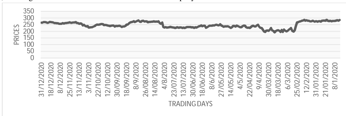
Fig 3 Plot of the underlying price of Coca-Cola for 2020

From the result in Table 3, we observed that the Skewness is positive (2.8991) and high kurtosis of about 12 with low volatility of about 0%, meaning low risk in the investment of Coca-Cola Company for 2020.