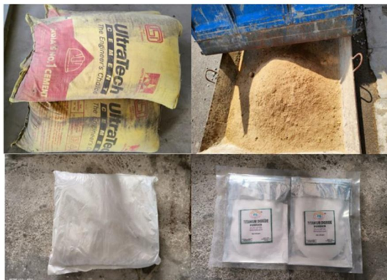
Fig No 5.1: Collection of materials