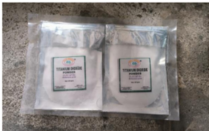
Fig 4.4: Titanium Oxide Sample

The effect of \text{TiO}_2 on cement clinker phase formation, ion substitution as well as hydration properties were evaluated by free lime test, X-ray diffraction (XRD), scanning electron microscope-energy dispersive spectrometer (SEM-EDS), isothermal heat-conduction and nuclear magnetic resonance (NMR). Results indicated that titanium was preferentially incorporated in the interstitial phases, especially in C4AF, then C3A, C2S and C3S, which could be attributed to the lattice substitution of \text{Ti}^{4+} to \text{Fe}^{3+} in C4AF and consequently weakened its crystallinity. Meanwhile, the threshold limit for \text{TiO}_2 incorporated into clinker was 1.5 wt%, beyond which, the crystal form of C3A transformed from cubic to orthorhombic. These changes of C3A and C4AF promoted the formation of C3S by decreasing the liquid phase viscosity during the sintering process. \text{TiO}_2 -doped promoted the hydraulic activity of clinker in initial period while postponed the hydration process of C3S in later period. However, after 28 days hydration, C-S-H gel polymerization degree did not decrease but improved as the \text{TiO}_2 dosage was below 1.5 wt%. Alkali activator: NaOH, \text{Na}_2\text{SiO}_3 , lime etc.