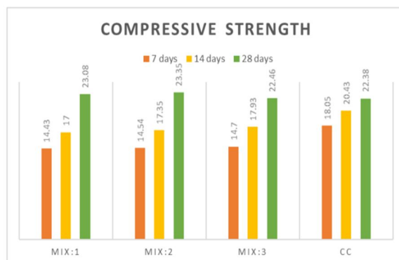
Fig No 6.1 Bar chart of compressive test of cubes using Sea Shell with TiO 2