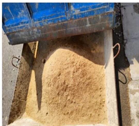
Fig 3.6: Fine Aggregates

The aggregate size of 4.75 mm and less is considered as fine aggregate, M sand was used in the present project work.