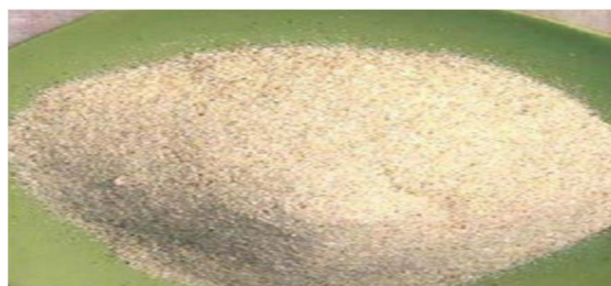
Fig 4.1: Sea Shell Powder