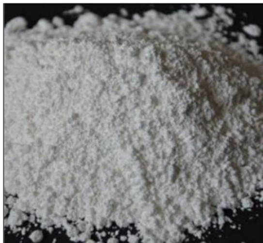
Fig. 4.3 Titanium Oxide Powder

A high value of this factor makes the \text{TiO}_2 a very good photocatalyst material, i.e. a substance, which initiates a catalytic reaction in presence of light and what is more it is not consumed. According to the development of photocatalytic building materials can contribute to environmental purification and improve the level of sustainable development. Thanks to the excellent photocatalytic properties \text{TiO}_2 is recently used in many different construction technologies, including technology of cement and concrete. Technologies using photocatalytic properties of \text{TiO}_2 are increasingly used for production of self-disinfecting materials, self-cleaning surfaces and purification the air from odours.