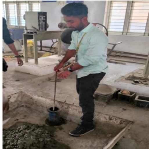
Fig No 7.1: Test for fresh concrete 40

The mould is filled with concrete in three layers of equal volume. Each layer is compacted with 25 strokes of a tamping rod. The slump cone mould is lifted vertically upward and the change in height of the concrete is measured. Initial slump is measured after just lifting of cone and final slump is recorded after 45 minutes of lifting of cone.