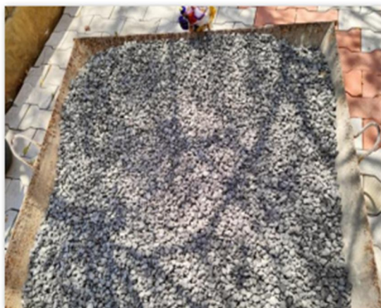
Fig 3.5: Coarse Aggregates

The size of aggregate bigger than 4.75 mm is considered as coarse aggregate. From various practical considerations, for reinforced concrete work, 20mm and 12.5mm down size coarse aggregate was used in the project work.