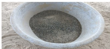
Fig.4 Crusher Waste