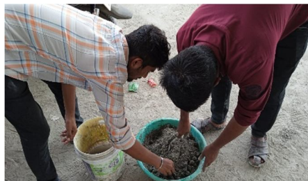
Fig.6 Mixing of Material

The bricks are cast using a standard hand mould, which has standard dimensions of 230 mm by 110 mm by 70 mm. They were poured in accordance with the established technique using different mix amounts. Prior to now, the necessary amount of fly ash, lime, gypsum, and crusher waste has been determined. The bricks are dried under sun from 24 to 48 hours, the dried brick are stacked and subjected for water spray curing once or twice a day.