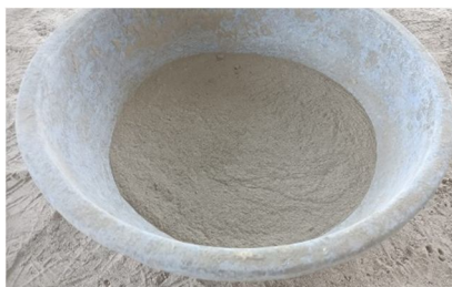
Fig.1 Fly Ash

A very fine powdery material known as cement is often composed of limestone (calcium), sand or clay (silicon), bauxite (aluminum), and iron ore, though it can also contain other materials like shells, chalk, marl, shale, clay, blast furnace slag, and slate. When cement and water are combined, a chemical reaction occurs that creates a paste that sets and hardens to bond the various building ingredients together.