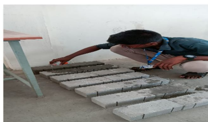
Fig.9 Water Curing of Bricks