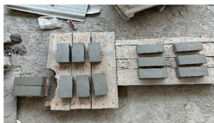
Fig.8 Air Curing of Bricks