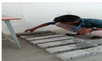
Fig.9 Water Curing of Bricks