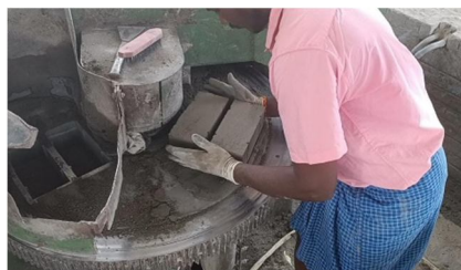
Fig.7 Casting of Bricks