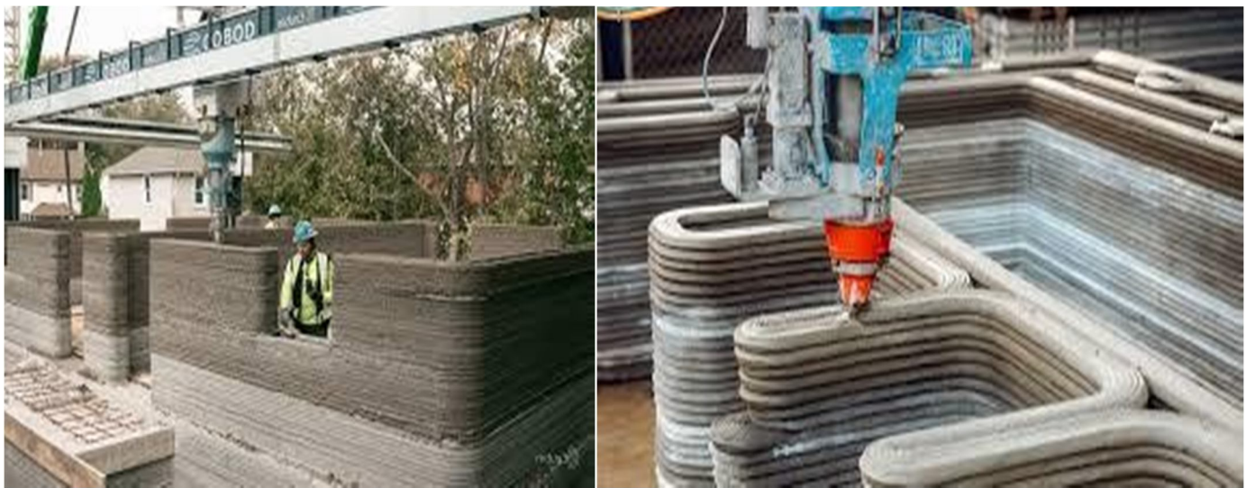
FIG.3 SAMPLE IMAGE

In the construction industry, 3D printing can be used to create construction components or to 'print' entire buildings. Construction is well-suited to 3D printing as much of the information necessary to create an item will exist as a result of the design process, and the industry is already experienced in computer aided manufacturing. The recent emergence of building information modelling (BIM) in particular may facilitate greater use of 3D printing. Construction 3D printing may allow, faster and more accurate construction of complex or bespoke items as well as lowering labour costs and producing less waste. It might also enable construction to be undertaken in harsh or dangerous environments not suitable for a human workforce such as in space. The 3D printing systems created specifically for construction are commonly known as "construction 3D printers." A 3D printing project typically starts with a 3D digital model of the structure that needs to be constructed. The model is virtually sliced into layers. The printing robot or gantry system then follows a pre-programmed path to deposit each layer of material, tracing the layer outlines and extruding material until it has completed the whole slice. Once one layer is complete, it begins the next on top of the first, and construction continues like this until the full structure is built. It may use materials such as concrete, metal, or polymers to form this 3D structure.