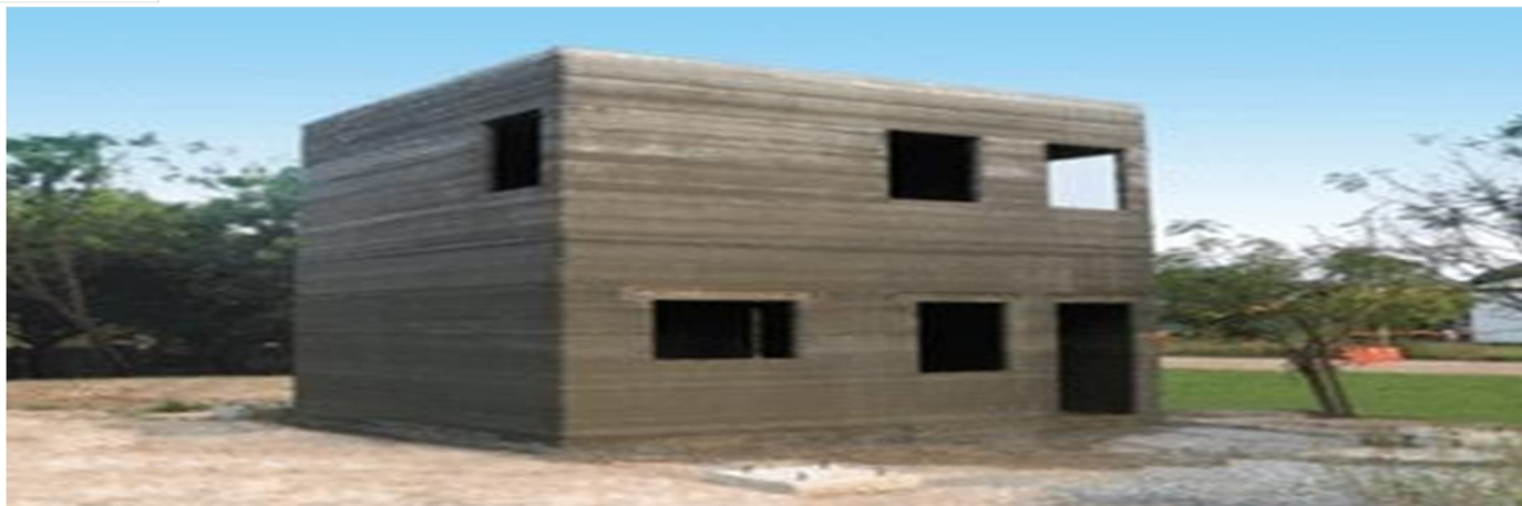
FIG. 10. Image of 3D Printed Two-Storey Building.

By demonstrating expertise in 3D printing, L&T Construction pushes the boundaries of automated robotic construction. The project aligns with India's goal of providing real housing for its citizens as part of the 'Housing for All by 2022' program.