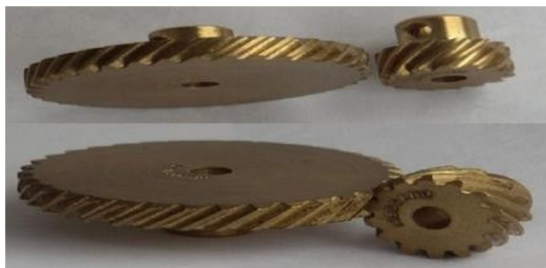
Fig 2 Helical Gear

Helical or "dry fixed" gears offer a refinement over spur gears. The leading edges of the teeth are not parallel to the axis of rotation, but are set at an angle. Since the gear is curved, this angling makes the tooth shape a segment of a helix. Helical gears can be meshed in parallel or crossed orientations. The former refers to when the shafts are parallel to each other; this is the most common orientation. In the latter, the shafts are non-parallel, and in this configuration the gears are sometimes known as "skewgears".