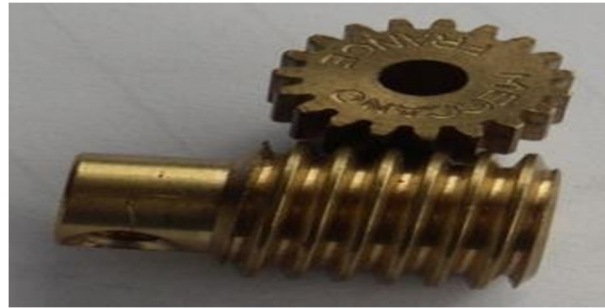
Fig 3 Worm Gear