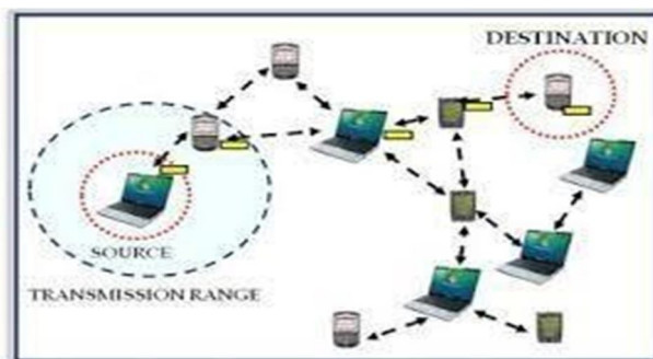
Figure 1. Working principle of MANET

In the era of wireless technology the MANETs are one of the most efficient technology used for transmission of data. For example:- Wifi-direct, Bluetooth. It helps to connect the devices from the source to the destination without he need of stable infrastructure and any fixed establishment of accessible resources[1]. Several times, when the mobile users need to connect with the wireless structure at that point this help to communicate from one user to the another users with the help of this wireless technology and this can reduce the infrastructure requirement that can also easy to maintain and less security issues and there is no need to create space environment because it is movable connection that can easily handle within several temporal conditions[2].To demonstrate this concept, take an example if the group of users want to communicate with one- another for some organization purpose, if the one of the user is travelling at a point and the other users are at other places then there is no need to create a permanent network[3], at these type of conditions users can dynamically create an temporary connection that will help to communicate with one-another[4].