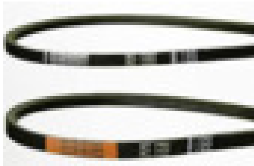
Fig 3.5 Belts