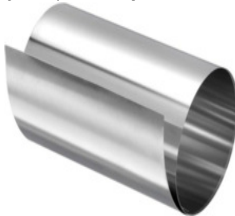
Fig 3.2 Stainless steel