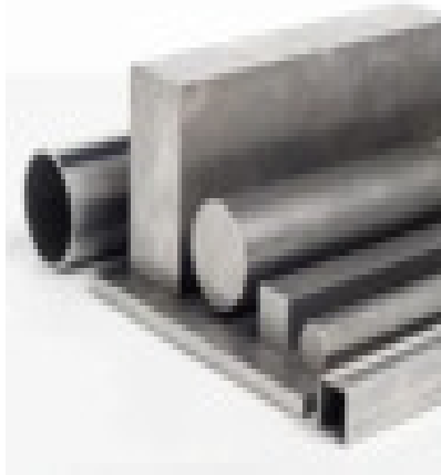
Fig 3.1 Mild Steel