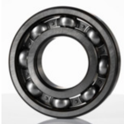
Fig 3.4 Bearings