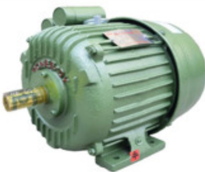
Fig 3.3 Electric Motor