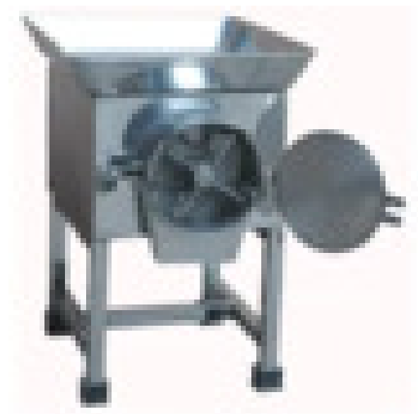
Fig 6.2 Outputs Model