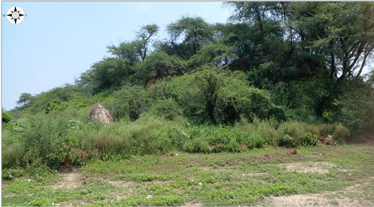
Image 4: Location of part of Mound from which skeleton, bones seen.