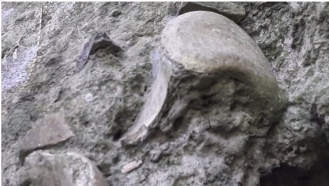
Image 2: Bones recovered near Raghunathji Mahal. Might be there is ancient crimation Centre here. There is one jaw of animal (?) also found near this bone and mingled potsherds also seen at this site (in Sept,2020).

Now recently received biological evidence has made it clear that along with history, archeology, there is full potential for bio-archaeology.