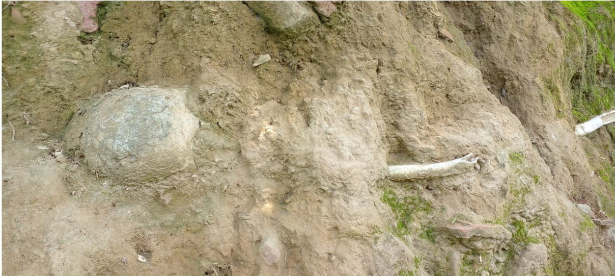
Image 10 : Skull and bones. On upper side of skull red sandstone is visible