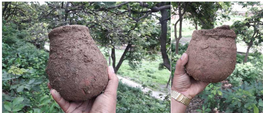
Image 1: Kushan Period Pots