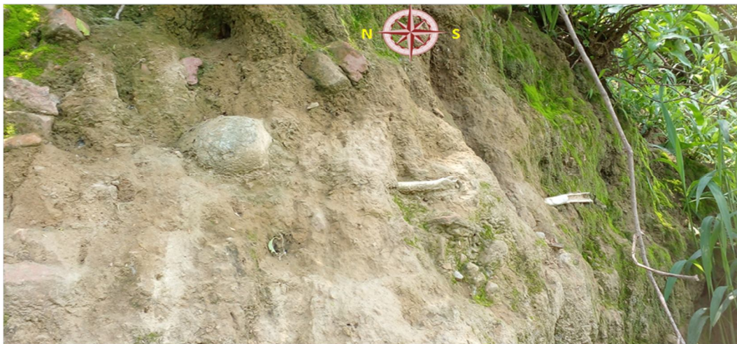
Image 6: Skull and bones of skeleton. Behind the skull there is a wall like structure.