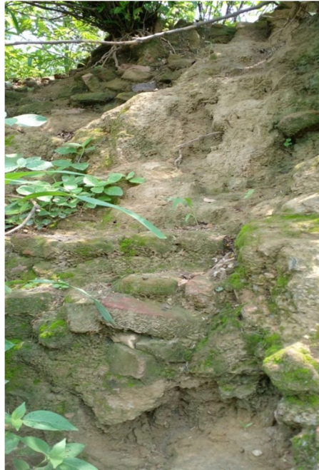
Image 7: Bone in between bricks. The brick is likely to be as same as Kushan Time brick