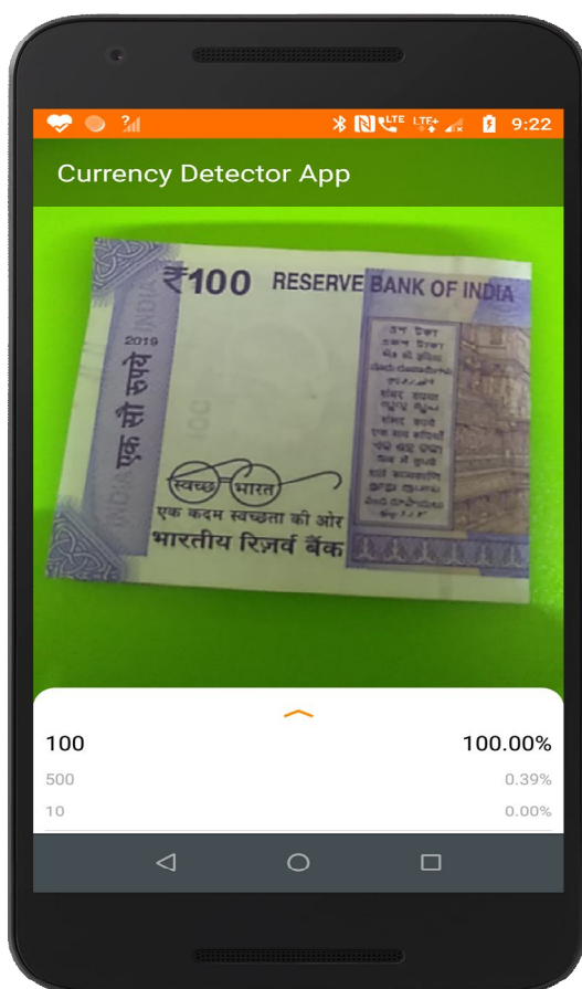
Fig 2. Snapshot of output of 100 rupees note taken from Android Emulator in Android Studio